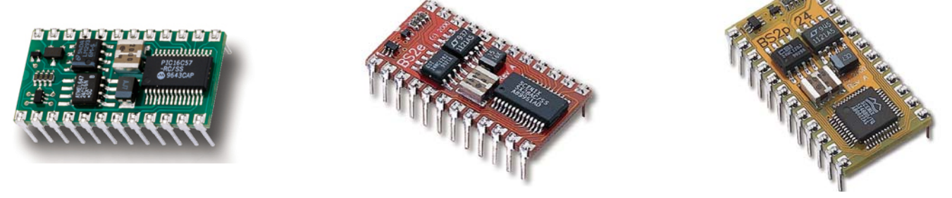
BASIC Stamp 2p24

The BASIC Stamps (some are pictured below) are small programmable controllers intended for general-purpose use. They are programmed in a variation of the BASIC programming language, called PBASIC, and are frequently used by industrial, commercial and R&D engineers, educators (in classroom electrical/software engineering sessions) and electronic hobbyists.