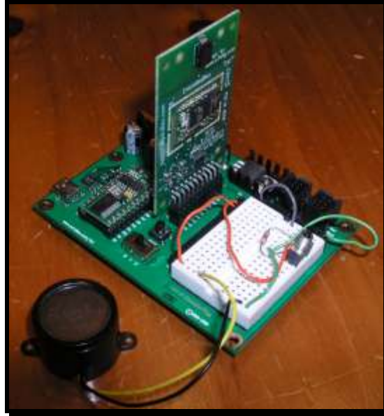
Figure 7: Connections to P14 (pushbutton) and P13 (piezo speaker) on the Board of Education.