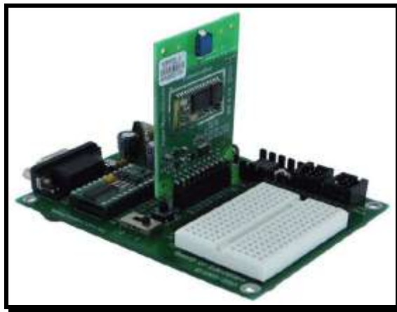
Figure 2: The Board Of Education carrier board with the EB500 connected.

We will use Option 2.b.i with the two PCs being one PC. Also, a serial Board of Education will be used for the BS2. The EB500 BT transceiver is available from Parallax Inc ( www.parallax.com , #30068). This device communicates with any other BT transceiver and makes the data received available to the BS2 via a serial link. Also data from the BS2 can be sent via a serial link to the BT transceiver to be sent to any BT transceiver ready for receiving it.