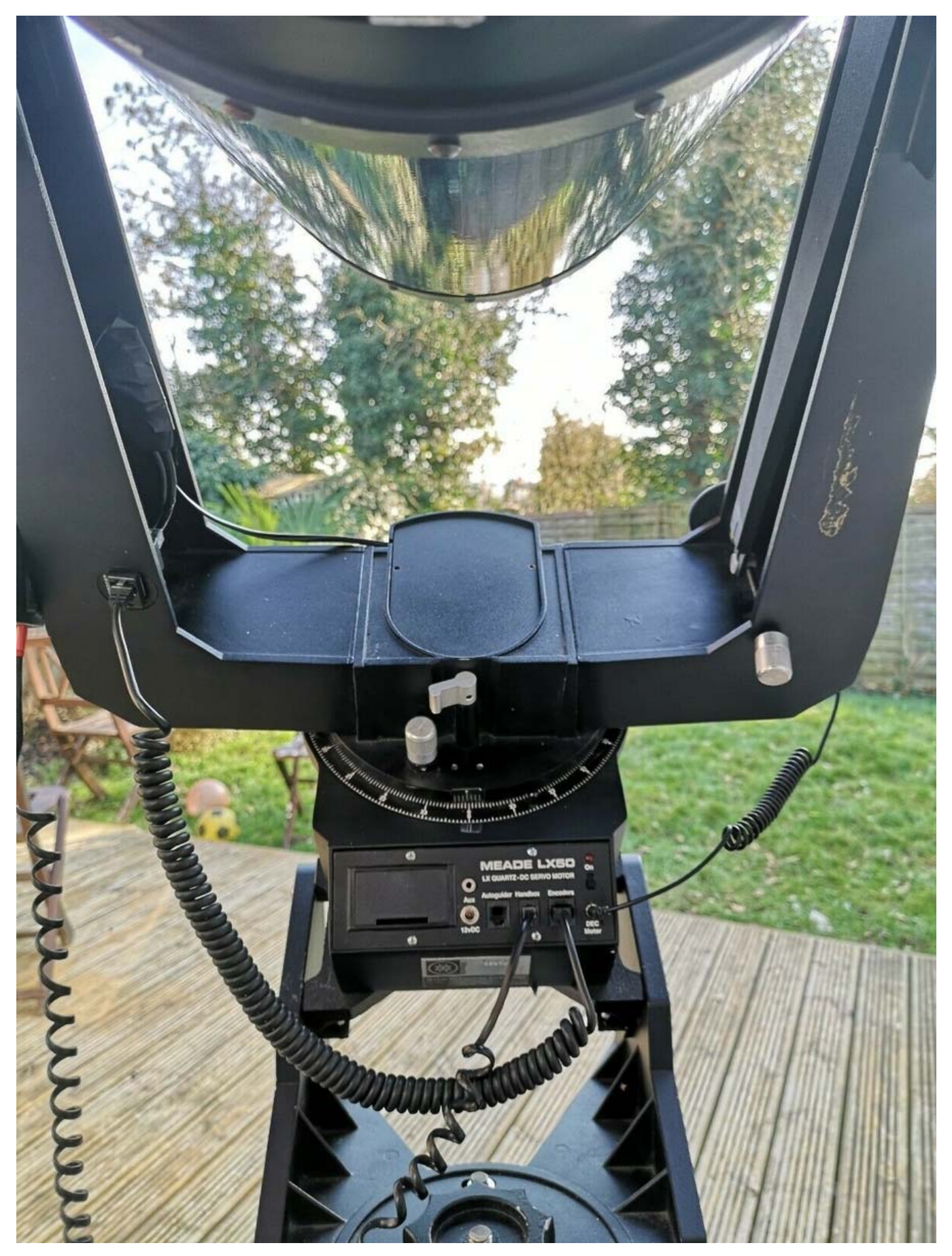
LX50 Telescope with Control Panel. Encoders and Handbox connected.