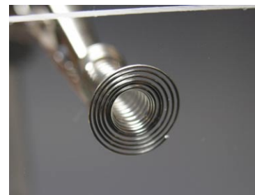
Fig 4 - Compressed spring, viewed from front through a clear panel. The channel in the middle can be used for an LED (as with the S-presso).