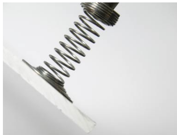
Fig. 3 - Spring after compression; the conical section collapses to form an electrode disk.