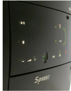
Fig. 7 - Exterior of S-presso front touch panel.