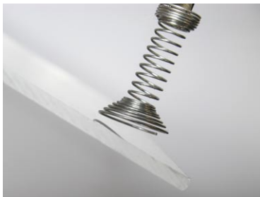
Fig. 2 - Spring before compression.

Finally there is the PCB end, which can come in several different variations. One simple variation is to wind the