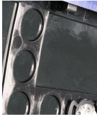
Fig. 6 - S-presso interior panel moulding has round recesses to hold collapsed conical spring sections in position.