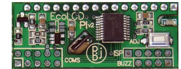
Backpack module (actual size)

The serial input is typically driven from RS-232 signals where the line idles at 2.5V or more. Baud rates are programmable from 1200 to 115200 baud (9600 baud default). No handshaking is required and the unit can be driven from a single RS-232 transmit line (2-wire mode). Auto polarity sense is used so that RS-232 or non-inverted logic signals may be used without configuring. The serial input may also be programmed to accept device selection codes to permit operation of multiple displays on the one serial port. In addition to asynchronous serial input the module can also connect to an I2C bus as a slave device at address $7A.